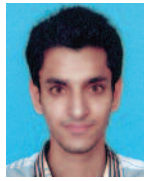
Shehroz Sohail BS41 3610

The prime minister sanctioned Rs8 billion for reconstruction of 1,000 schools destroyed in the devastating earthquake in 2005 in Khyber Pakhtunkhwa and Azad Kashmir, said Federal Minister for Religious Affairs Sardar Mohammad Yousuf here on Sunday.