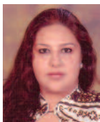
Sehar Nadeem BS41 3607

Pakistani poet and writer Harris Khalique has been included in a prestigious publication "Windows on the World – 50 writers, 50 views", said a press release.