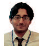
Omair Abbas MS38 3293

At a time when the Pakistan Cricket team has been marred by one crisis after another, from the match fixing scandal implicating some of its top players, to the countless administrative blunders and misjudged decisions undertaken by the cricket administration, one man is still holding the reputation of Pakistan cricket and the flag of the nation high, making us proud, and that man is none other than Aleem Dar.