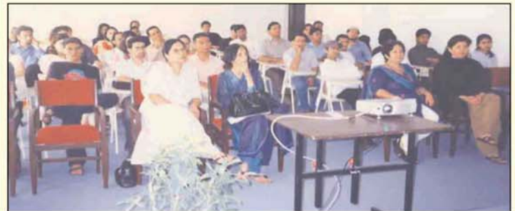
The audience - all ears!

On the whole, the presentation was very informative, and gripped the attention of the students who asked many questions from the presenter. ■