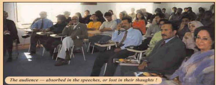
The audience — absorbed in the speeches, or lost in their thoughts!

ated a lot of interest, not only among the participants, but also the student community in general.