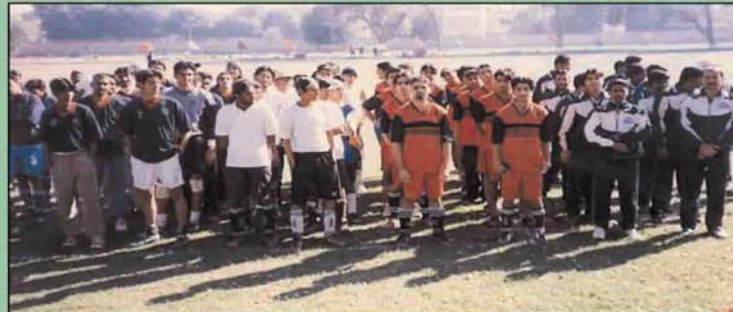
Group photograph of the participating teams of football at Sindh Agriculture University, Tando Jam.

Sports is a major catalyst towards the physical and mental health of the youth