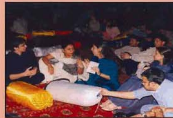
Students relaxing during the break.

more than off-set by the warmth of feelings in the heart of all who happened to be there. Altogether it turned out to be an enjoyable and a memorable evening. ■