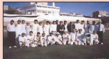
Cricket teams of Greenwich University and Textile Institute of Pakistan are photographed with their officials.