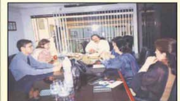
The WES officials together with Greenwich staff.

One of the points that came across clearly was that apart from other evaluation criteria, a reasonable level of proficiency in English is a major criterion which directs and determines the admission procedures in foreign universities.