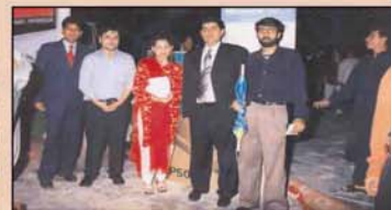
The first prize winner with the faculty and officials of the TV Company.

Designed & Produced by: Public Relations & Corporate Affairs Department, Greenwich University ♦ Views expressed here do not necessarily represent the views of the University or its officials.