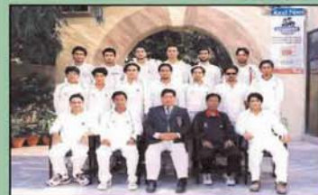
The Greenwich Cricket Team which participated in the Cricket Matches.

Greenwich also participated in the football matches which were organized at Sindh Agricultural University, Tando Jam. Eleven teams from the