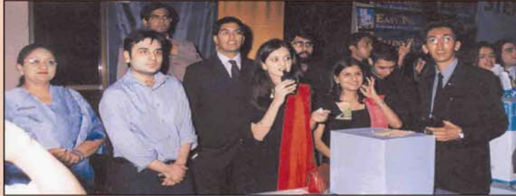
The winner is .....

Even though the main objective was to learn the vital skills of the Cost and