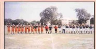
Group photograph of the participating football team at Sindh Agricultural University, Tando Jam.