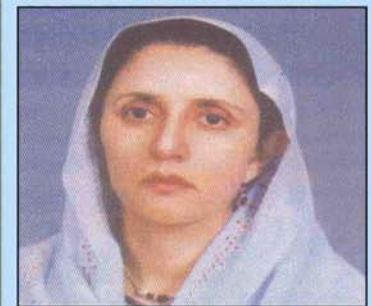
ZOBAIDA JALAL Federal Minister for Education

T HE First Pakistan University Games were held in Islamabad from February 09 – 15, 2004. In her message on the occasion, Ms Zobaida Jalal, Federal Minister for Education, stressed the importance of sports in the nation building activities.