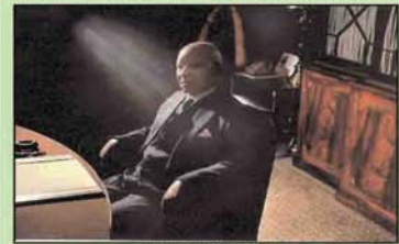
President Banda founder of the Kamuzu Academy

of funds for the nation's secondary and tertiary level establishments. Today the buildings no longer resound to the sound of Homer or Socrates. The Great Hall no longer reverberates to the sounds of orchestral concerts or productions of West End musicals. The Greek theatre lies overgrown and the Chinese gardens untended.